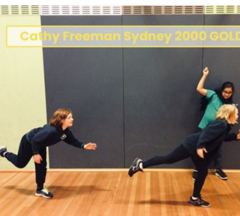
Cathy Freeman Sydney 2000 GOLD